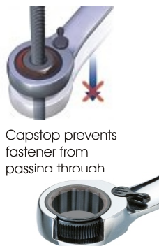
Capstop prevents fastener from passing through

34688 Sugg Retail $178.54 15° Offset, Bolt Capstop Forward/Reverse Switch 5/16, 3/8, 7/16, 1/2, 9/16, 5/8, 11/16, 3/4"